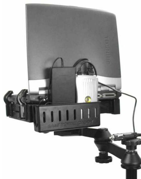
RAM-234-3 UNIVERSAL LAPTOP TRAY SHOWN WITH COMPUTER AND OPTIONAL #RAM-234-5 POWER CADDY FOR HOLDING VARIOUS AFTERMARKET POWER SUPPLIES

RAM is the revolutionary universal mounting system that allows you to mount practically anything anywhere. Whether its in a boat, aircraft, automobile, ATV, motorcycle or any other situation, RAM's family of over 800 interchangeable accessories will offer you solutions to your most challenging mounting problems. If you need to mount a radar, sonar, GPS, computer, cellular phone, antenna, or just about anything else look no further. RAM mounts will help you make a professional job easy and affordable. They will allow you to reposition or remove your electronics for perfect viewing or safe keeping. It's unique design provides easy installation, mobility, strength, versatility, vibration protection and durability, all at a low cost. RAM is backed by NPI's renowned Lifetime Warranty which makes it the mounting system of choice. To provide light weight strength and corrosion resistance, RAM is made of marine grade aluminum with a powder coated finish, stainless steel hardware and rubber balls.